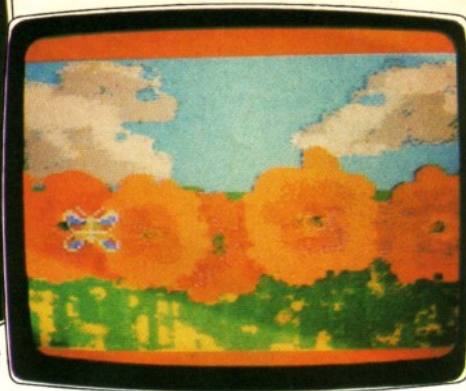
Two sprite scenes. Arcade Board, left and center; SuperSprite, right.

is because these images are multi-plane —the entire image is composed of many parts, and each part does not have to be redrawn with each move.